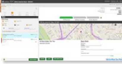
Vehicle Inspection Report Host Dashboard