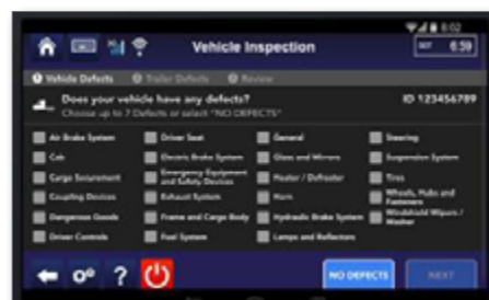
Vehicle Inspection Form